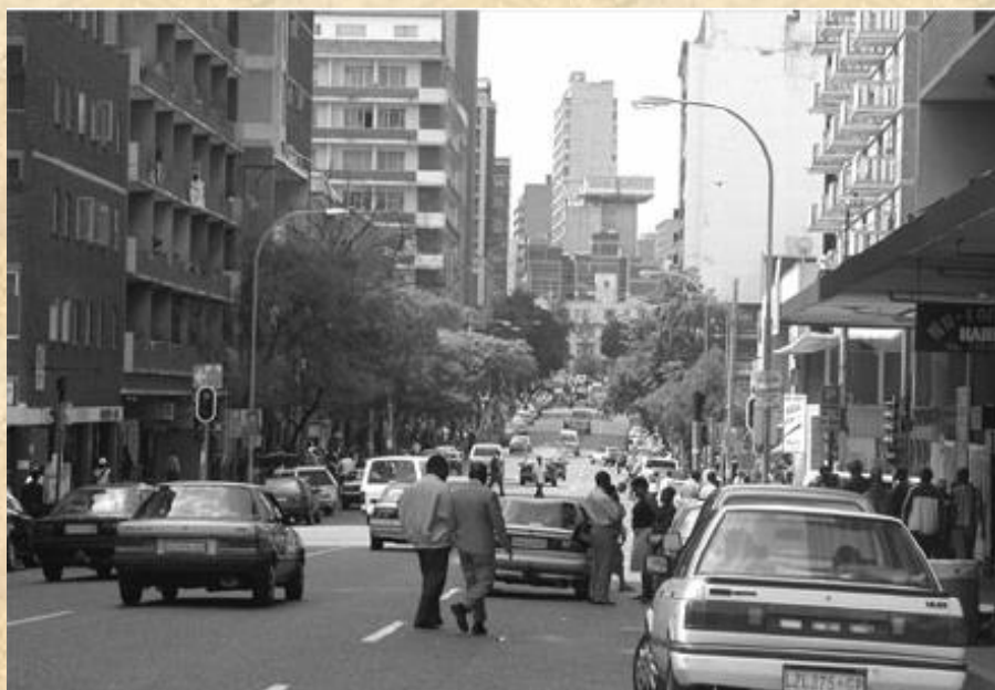
The Streets of Johannesburg in the 1980's. More modern cars and no more busses.