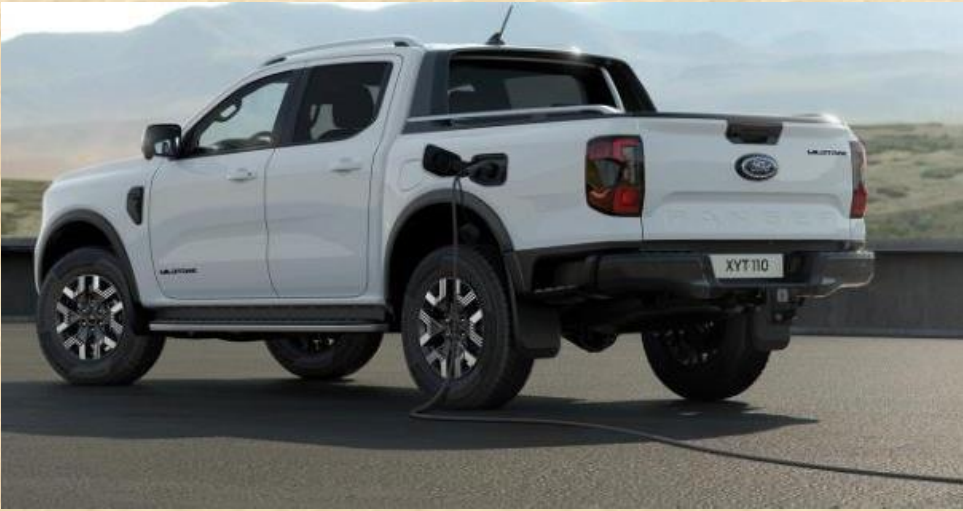
2025 Ford Ranger Hybrid Pick Up

In 100 years Ford went from the pick up above to the Pick Up below!