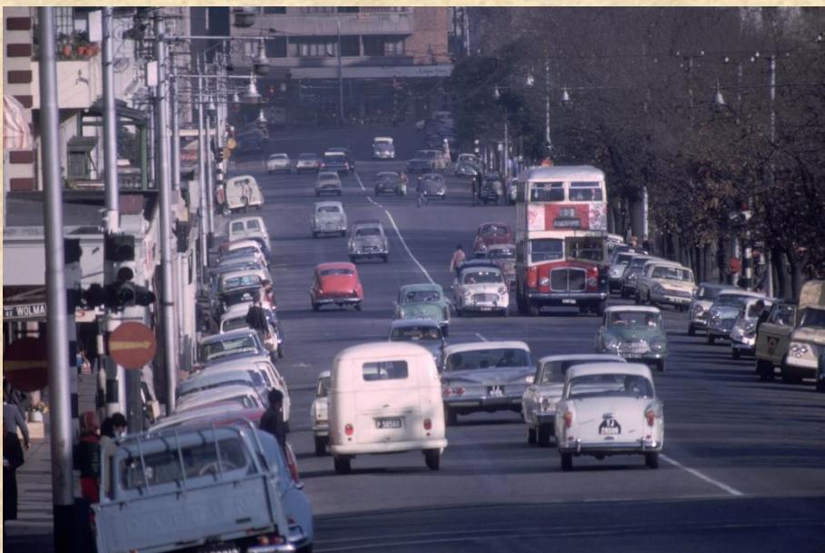
The Streets of Johannesburg in the 1960's. More modern cars and busses with no more trams