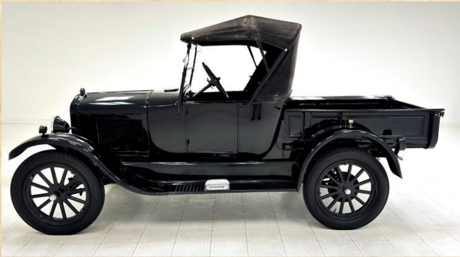
1926 Model T Ford Pick Up

In 100 years Ford went from the pick up above to the Pick Up below!