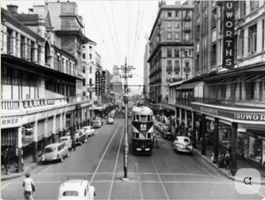
The Streets of Johannesburg in 1950's. Trams and cars.