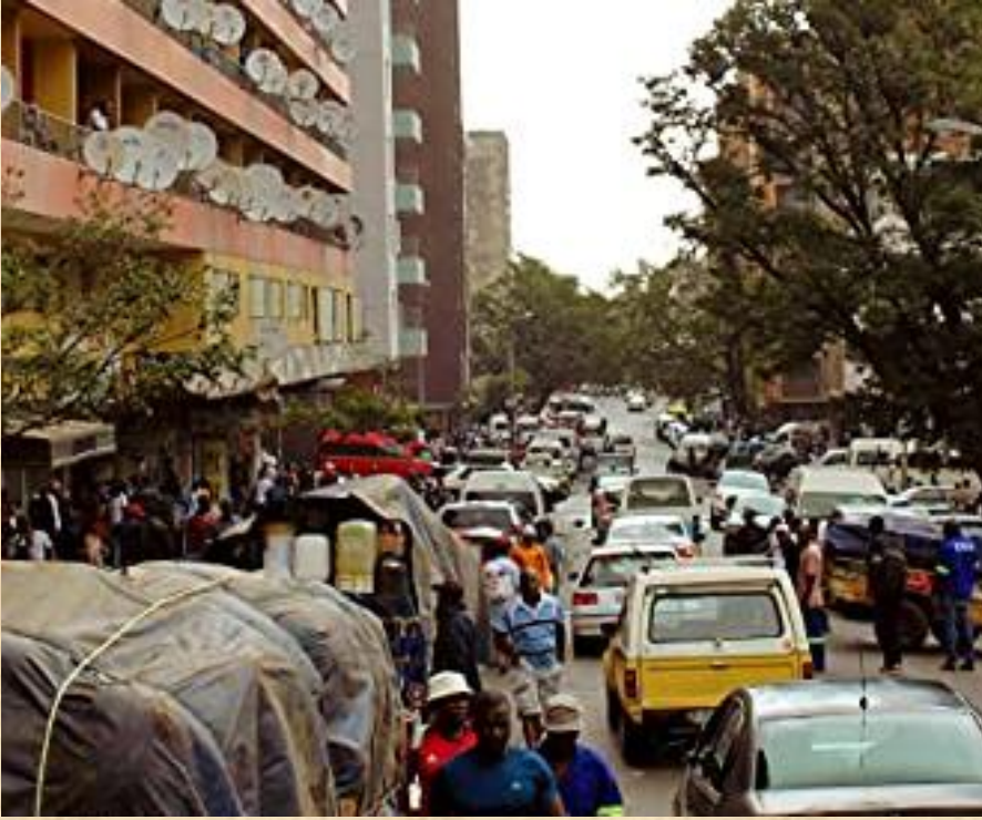
The Streets of Johannesburg in 2025. Chaos – anything goes.