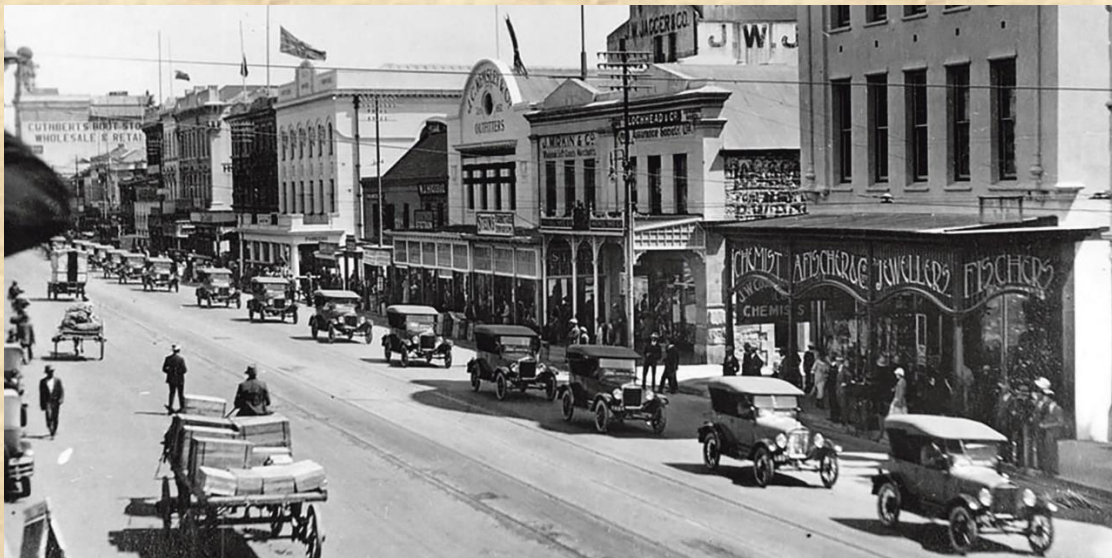
A Ford Model T cavalcade in the 1920s in Port Elizabeth following the success of the production facility in Port Elizabeth.

In 1923, Ford assembled 10 Model T cars per day at a disused wool shed in Struandale, Port Elizabeth. Today, it manufactures 720 vehicles per day at its Silverton plant in Pretoria.