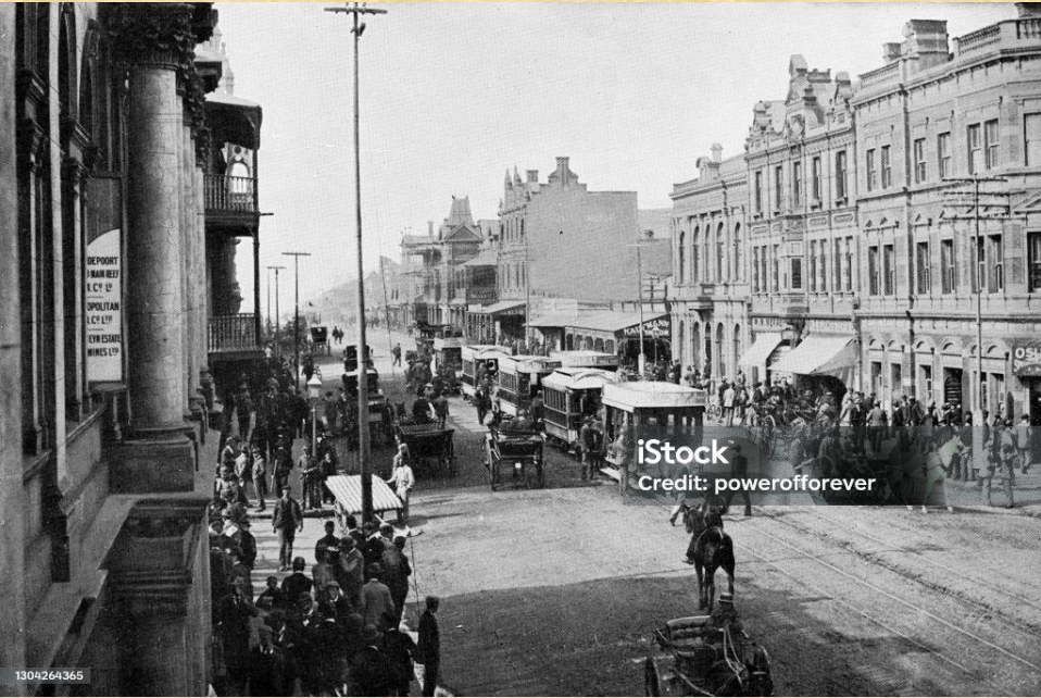
The Streets of Johannesburg in 1900. Only horse - drawn carts and trams.